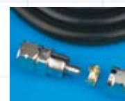
Hose by the metre H-7503 & PA-HC-4543